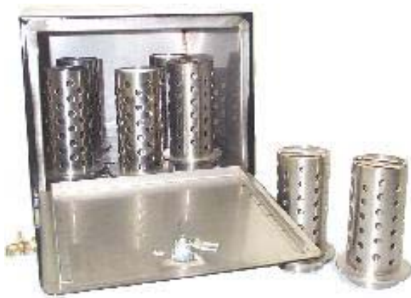
Steam dewaxers are available in different sizes. This one can hold several flasks.

Steam dewaxing machines should be used to re- move most of the casting wax instead of burnoff ovens. Burning off casting wax releases sulfur and chlorine gases. Steam dewaxing machines melt most of the wax from the flasks and deposit it in shallow water-filled trays. Make sure that the steam dewaxing machine actually allows the water to boil when gener- ating steam. Machines that cannot reach boiling temperature are less efficient and make the dewaxing process time consuming. You can then use a burn- out kiln to remove the residual wax as well as to heat and cure the investment. Select the standard time and temperature settings for your particular investment to ensure the best product quality.