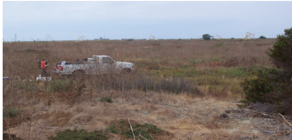
Fieldstone Property looking northwest. In the foreground is part of area proposed for cleanup.